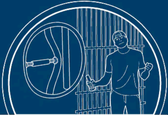
PRISON BREAKING ENGINEERING